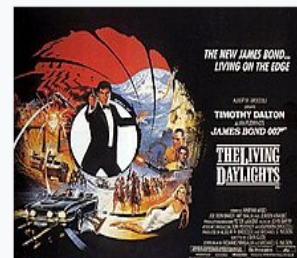
Theatrical release poster by Brian Bysouth